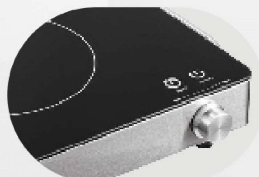
TEMPERATUE CONTROL KNOB