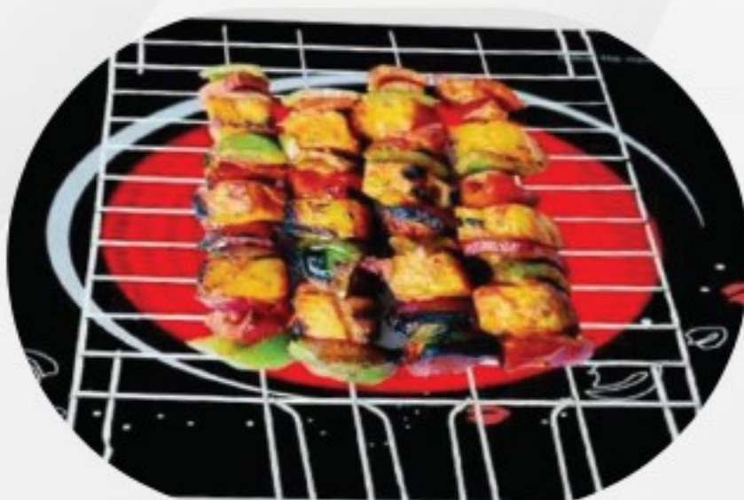
GRILL AND SKEWER SET (OPTIONAL)