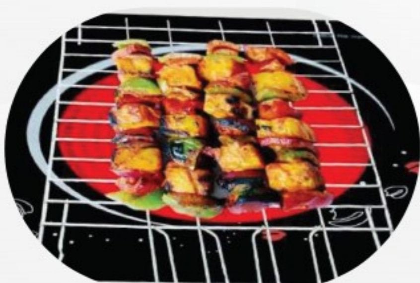
GRILL AND SKEWER SET (OPTIONAL)