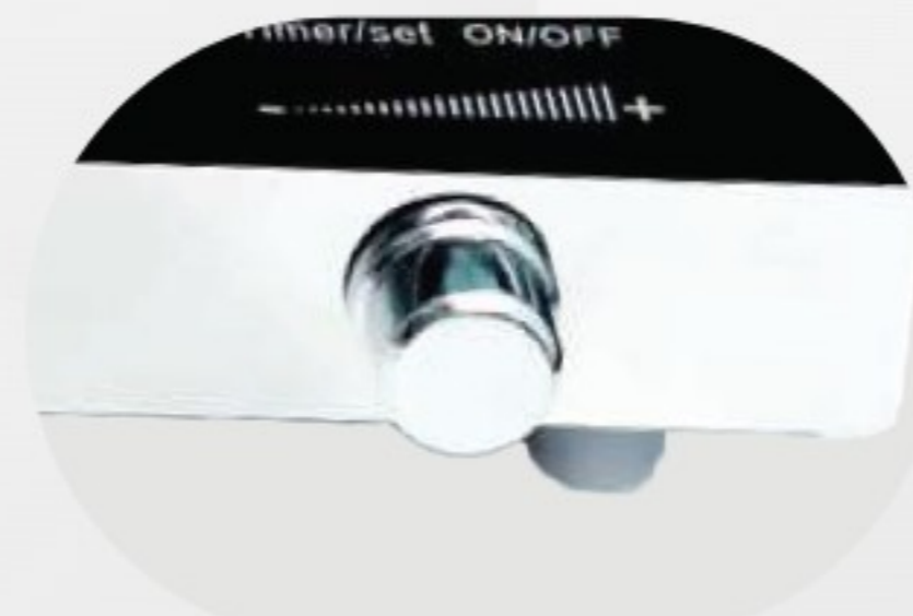
TEMPERATURE CONTROL KNOB