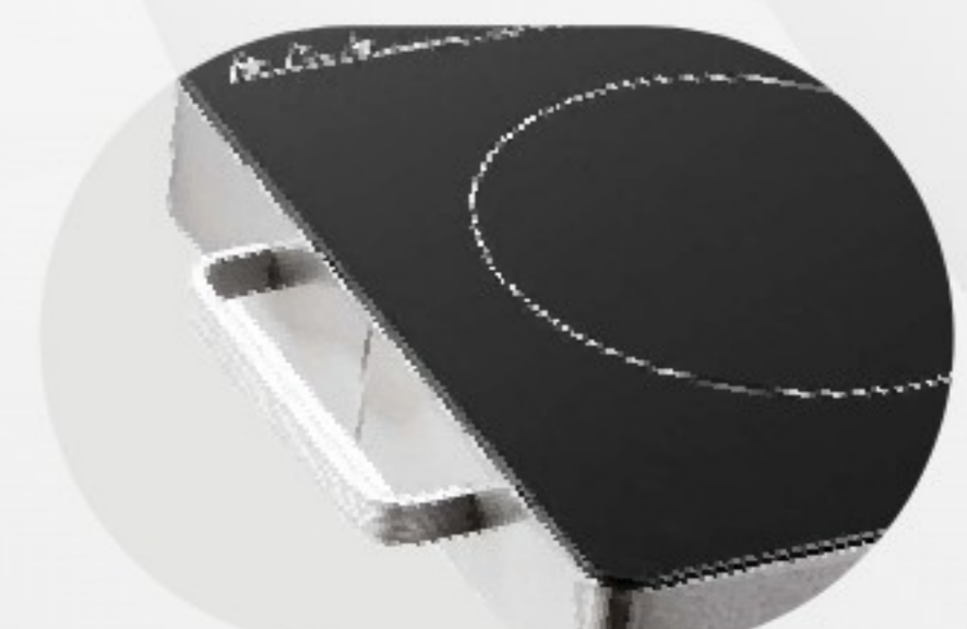
EASY TO HOLD HANDLE