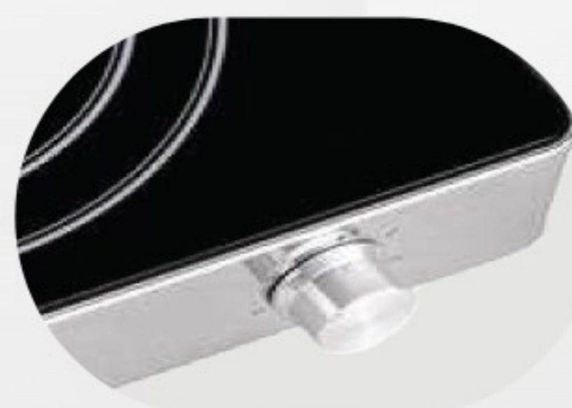
TEMPERATUE CONTROL KNOB