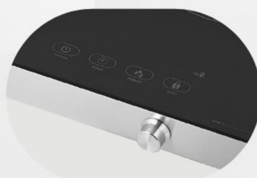
TEMPERATURE CONTROL KNOB