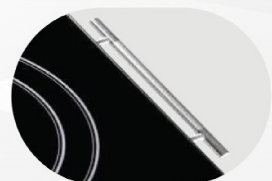
EASY TO HOLD HANDLE