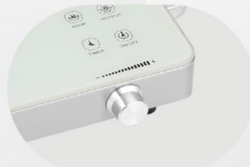
TEMPERATURE CONTROL KNOB