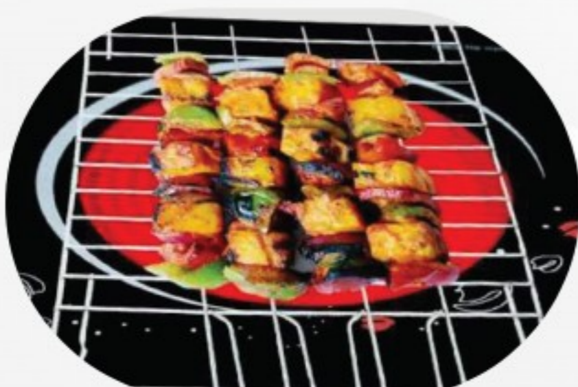
GRILL AND SKEWER SET (OPTIONAL)