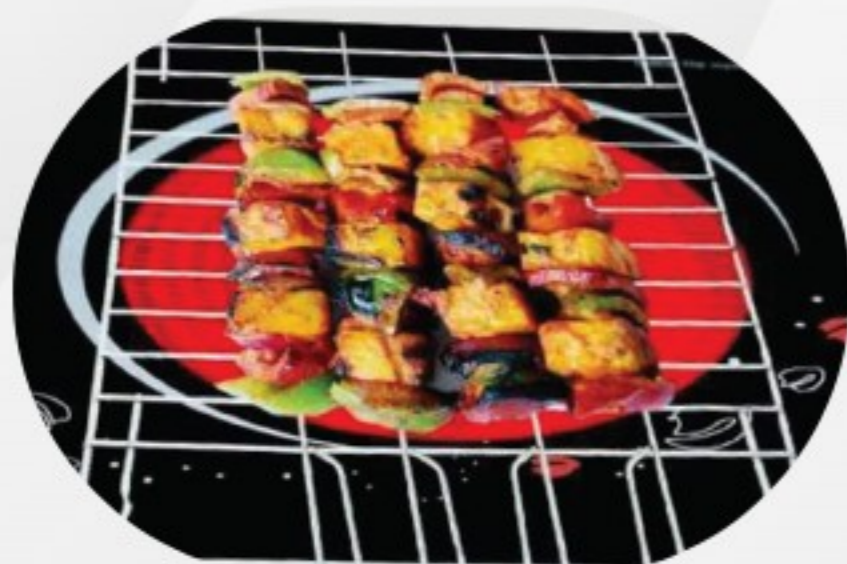
GRILL AND SKEWER SET (OPTIONAL)